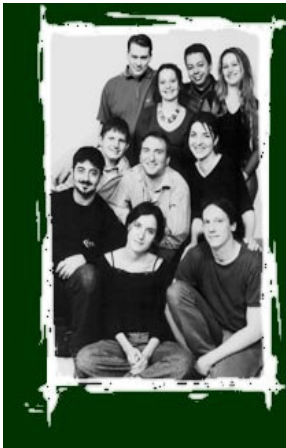
Budapest's Kava Cultural Group.